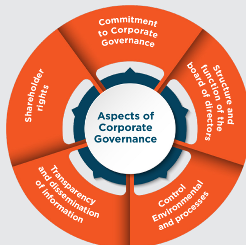
Illustration 1. Aspects of Corporate Governance