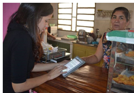
Credicedula client participating in survey.

In Paraguay, only 31% of adults have an account with a formal financial institution, compared to a regional average of 54%. In addition, only 13% of Paraguayans report having obtained credit from a formal financial institution in the past year. 2 These figures are worse for individuals with lower incomes and without credit histories.