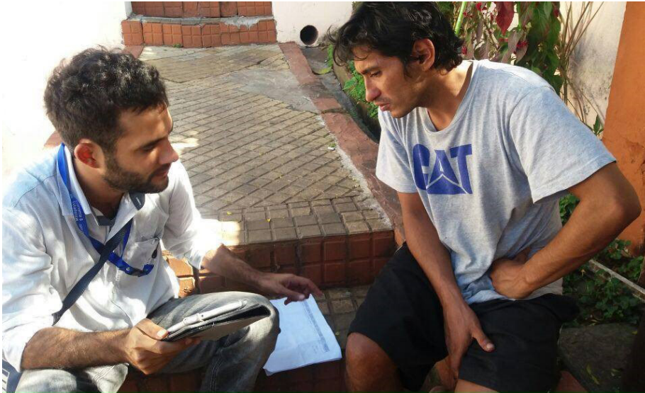
Credicedula client participating in survey.

below the threshold and were denied access. By focusing on the range of scores marginally above and below the threshold, a sample of 1,060 individuals with very similar characteristics in terms of the bank's scoring system was identified. Eligible and ineligible applicants were also identical in terms of access to credit before they applied for Credicedula in 2014 to 2015.