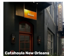
Catatoula New Orleans