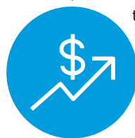
Figure 2. Variation in Quarterly Sales Due to Credit (%)

This effect was also clear in the months following the implementation of COVID-19 lockdowns and social distancing measures in Argentina: the quarterly sales of MSMEs receiving the credit in the second quarter of 2020 within the MELI ecosystem were 55% higher than those that did not receive credit, and 36% higher in the following quarter.