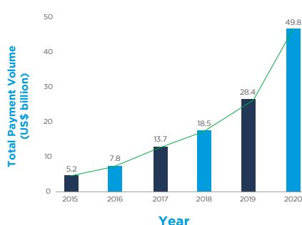
Figure 1. The MELI Ecosystem: Evolution of Digital Transactions (US$ billion)

To promote greater uptake of e-commerce among MSMEs, it is important to understand the barriers that hinder their participation in the first place. These include persistent digital gap problems (lack of internet connectivity, computers, and human resources with digital skills), informality, limited financial literacy, and underdeveloped